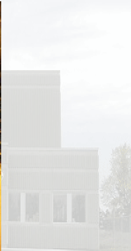
Processing & Storing Books at UTL Downsview